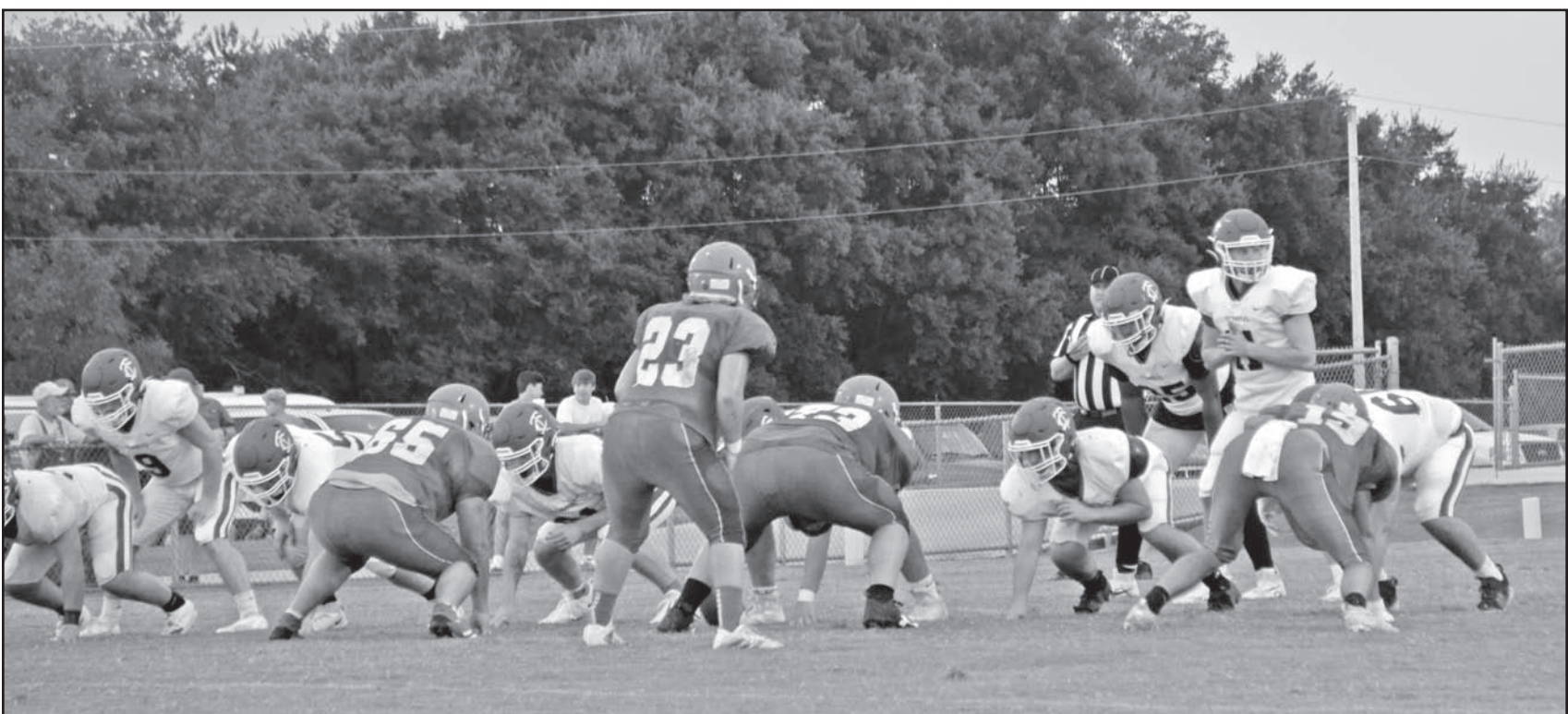
The Towns County offense goes to work during the first half of Friday night's scrimmage contest at Polk County, Tennessee.

Ingram once again took the kick at the 20-yard line, and after a very nice inside play, the Indians gained the first down but lost yardage back to the 40 on the next. Towns County ended up punting to